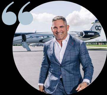
GRANT CARDONE Creator of the 10X Rule